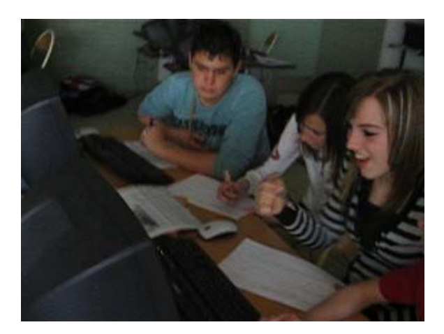
Figure 1. The forming of interest groups

To be a success, the task has to be reachable. The student must understand the situation, understand the data and manage to use the tools. That is why the game is organized in 4 steps and a previous session is devoted to teach the students the core concepts that are useful to solve the problem. The first step consists in a guided-tour of the kmz file with precise questions that help the students to use Google Earth, to read the maps, texts and other data, and to understand the railway project. In the second step, the students are more autonomous: by using the data in kmz files and their character card, they have to decide, individually or by joining interest groups, of their point of view about the project. They must also prepare a meeting where they will have to argue about their choices according to the role that they play. In the third step, they present their point of view and use their own kmz file to argue. They also have to answer to other character's questions about their point of view. The fourth step appears to be necessary at the end of the discussion: all the players have to negotiate to find an issue to the project, another place or another way to build it.