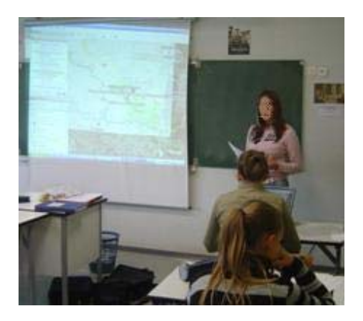
Figure 2. The presentation of the students' arguments during the "meeting"

The students' involvement in the game results also probably from the topic that has been chosen as well. The high speed railway loop project is close to the students' preoccupations. Most of them heard about it as the debate was mentioned in all the local newspapers and on TV screens. Furthermore, the "not in my backyard" reaction is easily understandable, even for a child. As a result the topic provides a motivating problem to be solved and finding a solution implies to deal with concepts that are the objectives of the teaching. The importance of hiding the objectives of the teaching has been discussed in previous works (Ahuja, Mitra, R, & M, 1995; Brousseau, 1986). This is also a key point to explain why the students are involved in their activities and not in a play that consists in trying to determine the purpose of the teacher.