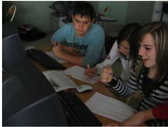
Figure 1. The forming of interest groups

To be a success, the task has to be reachable. The student must understand the situation, understand the data and manage to use the tools. That is why the game is organized in 4 steps. The first step consists in a guided-tour of the kmz file with precise questions which help the students to use Google Earth, to read the maps, texts and other data, and to understand the railway project. In the second step, the students are more autonomous: by using the data in kmz files and their character card , they have to decide, individually or by joining interest groups, of their point of view about the project. They must also prepare a meeting where they will have to argue about their choices according to the role that they play. In the third step, they present their point of view and use their own kmz file to argue. They also have to answer to other character's questions about their point of view. The fourth step appears to be necessary at the end of the discussion: all the players have to negotiate to find an issue to the project, another place or another way to build it.