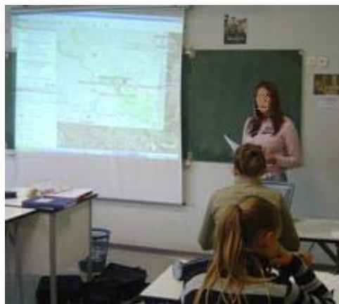
Figure 2. The presentation of the students’ arguments during the “meeting”

The students’ involvement in the game results also probably from the topic that has been chosen as well. The high speed railway loop project is close to the preoccupations of the students. Most of them heard about it as the debate were mentioned in all the local newspapers and on TV screens. Furthermore, the “not in my backyard” reaction is easily understandable, even for a child. As a result the topic provides a motivating problem to be solved and finding a solution implies to deal with concepts that are the objectives of the teaching. The importance of hiding the objectives of the teaching has been discussed in previous works (Ahuja, Mitra, R, & M, 1995; Brousseau, 1986). This is also a key point to explain why the students are engaged in their activities.